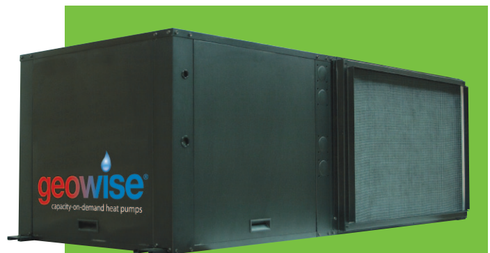
The world's only Capacity-On-Demand heat pumps by GeoWise® contributed greatly to the school's net-zero-energy rating. These unique heat pumps use less than half the energy required by other leading competitive brands.

What happens if any one of the elements of the system is overlooked? Years ago, I explored a career in auto mechanics and took a course in rebuilding engines. I had a Pontiac LeMans at the time and decided to blueprint the engine as my project. Each moving part was machined to precise tolerances and meticulously balanced. The valves were machined and special rollers with heavy springs were used. An Iskey ¾ racing cam, along with a racing distributor and coil, punched up the power. The intake and exhaust ports were ground and polished. When the engine was put back in the car, I expected a great increase in performance, but for some reason, it just didn't seem to perform as I thought it would. I ended up going back to college, abandoning the idea of being a mechanic, and selling my project to a close friend. He took the single-barrel carburetor off and put on a Holly four-barrel. He told me stories of pulling up next to some really hot cars and "blowing their doors off" with the tame-looking LeMans. All the difficult and expensive work I did was stymied by overlooking just one item!