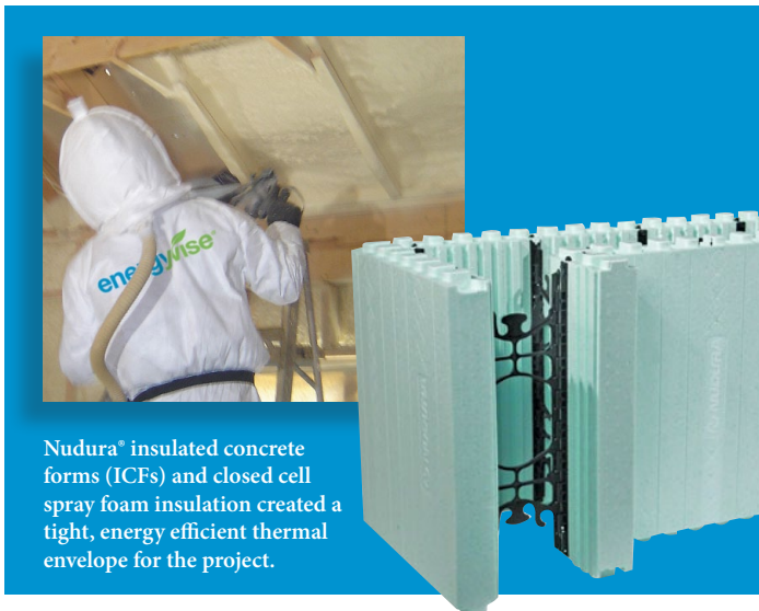
Nudura® insulated concrete forms (ICFs) and closed cell spray foam insulation created a tight, energy efficient thermal envelope for the project.

designed with a very good thermal envelope using foam insulation that minimized the effects of all three forms of heat transfer: convection, conduction and radiation.